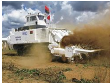
Demining equipment in operation in Angola