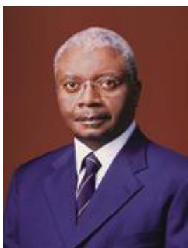
H.E. Mr. Armando Emílio Guebuza

“Africa enjoys enormous benefits from TICAD. Japan supports the essential sectors of education and human resource development, greatly contributing to capacity building and technology transfer in Africa.”