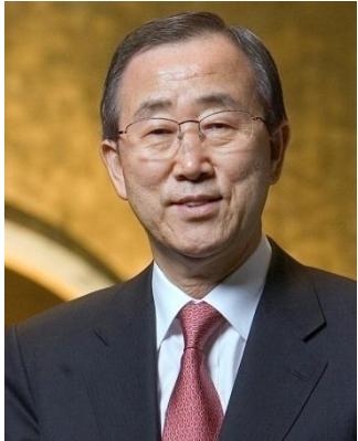
H.E. Mr. Ban Ki-moon