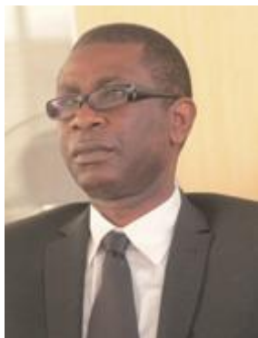
H.E. Mr. Youssou Ndour

Minister for Tourism and Leisure of Senegal