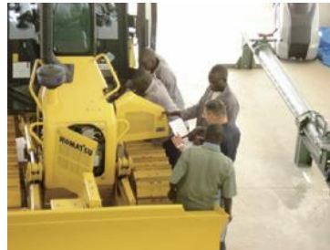
Providing training to CFPT trainers at KDTC

● JICA and Komatsu Ltd. collaborate in supporting the implementation of a heavy machinery maintenance course that CFPT started in 2012. Komatsu Ltd., with the cooperation of its local distributor, not only provides training to CFPT instructors at KDTC but also sends KDTC instructors to CFPT to provide training to CFPT trainees utilizing its facilities and equipment.